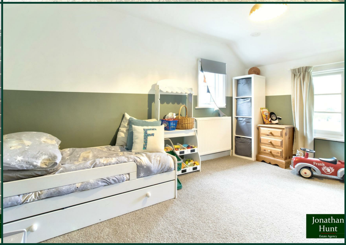
Jonathan Hunt Estate Agency